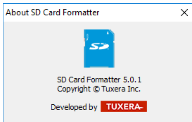
Figure 2: Version information

On macOS operating systems, click the [SD Card Formatter] menu and then click [About SD Card Formatter].